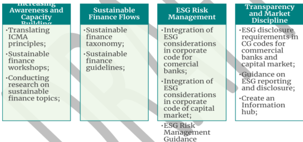
Diagram 3 Sustainable Finance Roadmap for Georgia

The specific steps that fall under each pillar are summarized on the Diagram 3 .