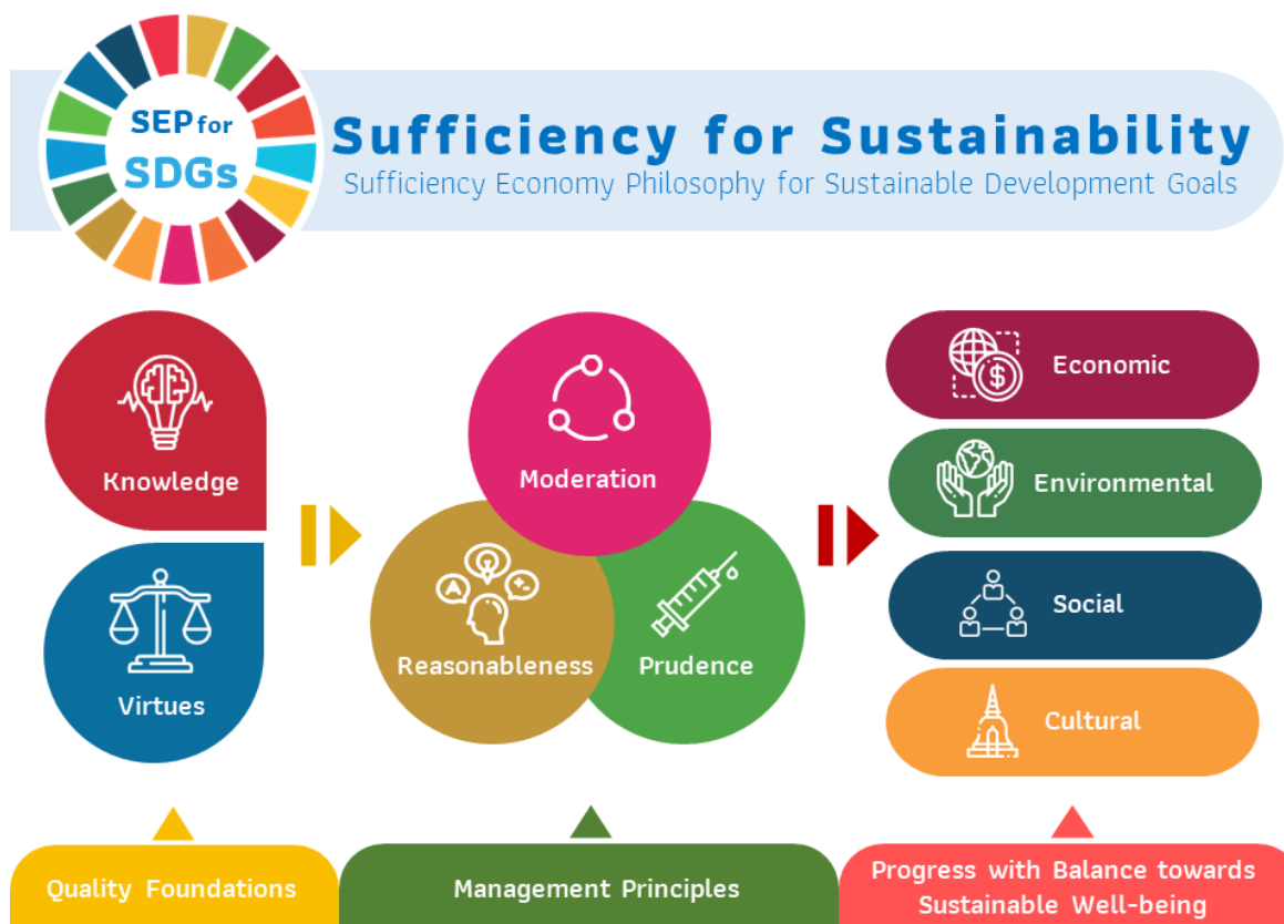
Sufficiency Economy Philosophy for Sustainable Development Goals of Thailand 2

Sustainability has been one of the key strategic priorities of the nation. The Sufficiency Economy Philosophy (SEP) of His Majesty the late King Bhumibol Adulyadej, Rama IX, has established the pathway for Thailand to achieve the United Nations (UN)'s 17 SDGs and become an integrated social and environmental economy.